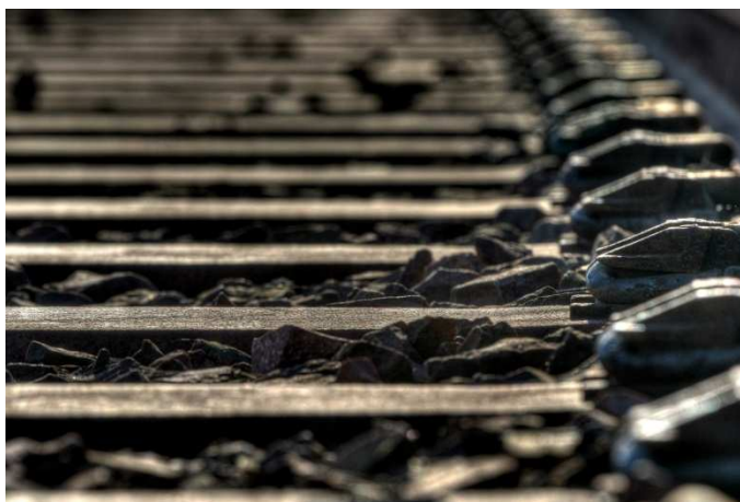
Sir Peter Hendy (CBE)